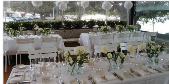
TABLE IN THE RESTAURANT