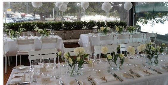
TABLE IN THE RESTAURANT